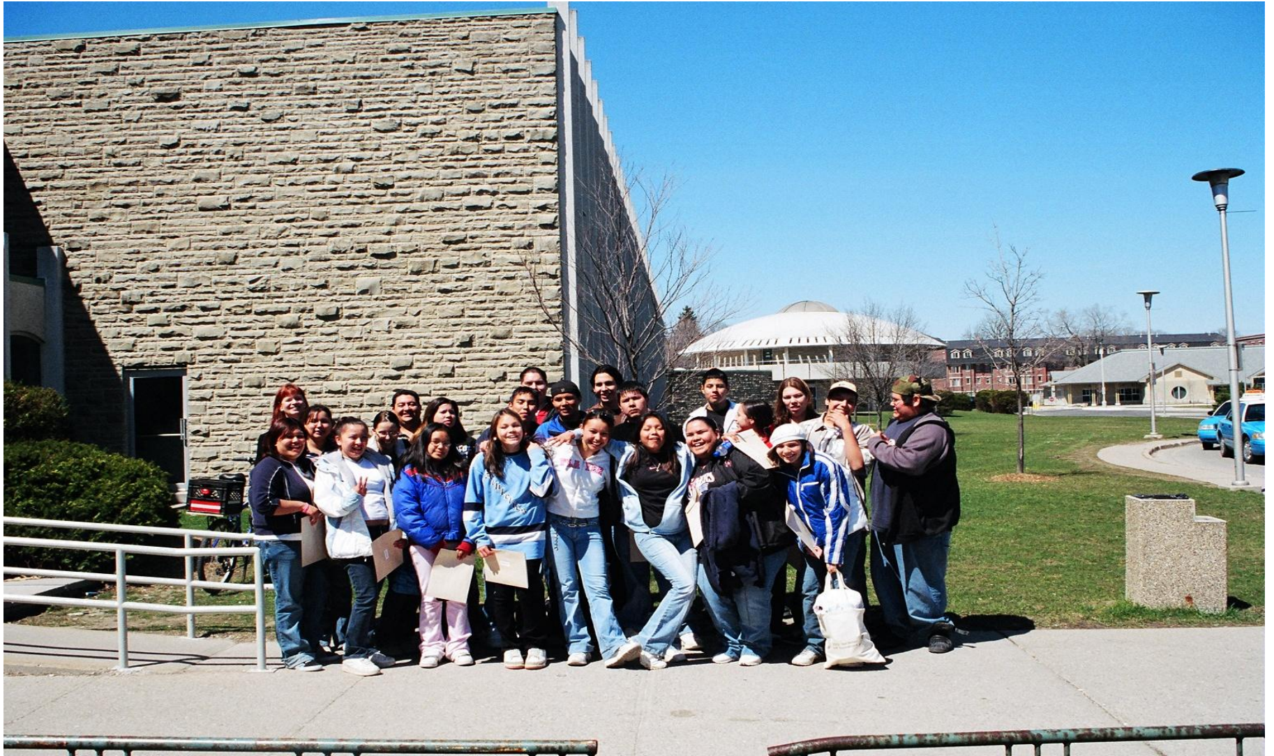
The Fourth R